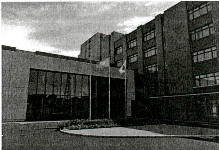
UNAFEI in Akishima, Tokyo

UNAFEI annually organizes three international training courses and one international seminar. Participants represent various regions of the world such as Asia, the Pacific, Africa and Latin America. This program contributes significantly to the training of personnel in criminal justice, and to providing ideas and knowledge for effective measures to combat crime in developing nations. For over 50 years, UNAFEI's efforts in training personnel have helped those individuals play leading roles in the criminal justice administration of their respective countries.